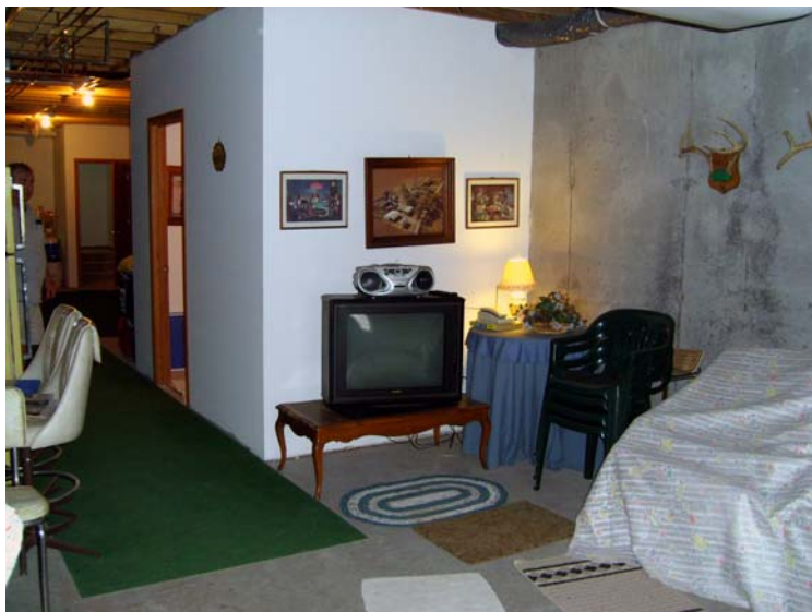
Partially Finished Basement